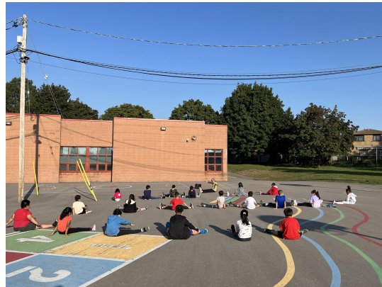
Grade 2 students doing Yoga.

Our focus for these beginning weeks of school is building community. When you build community, you help uplift people and encourage them to be part of something much bigger than themselves. Scholars feeling safe and secure in school helps them to focus their energy on learning. From Kindergarten to grade 8 you will see classrooms building community together through activities and lessons.