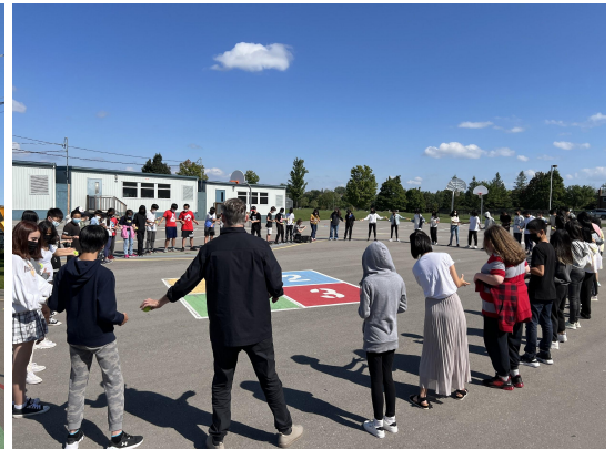
Grade 7 and 8 students doing a tennis ball challenge